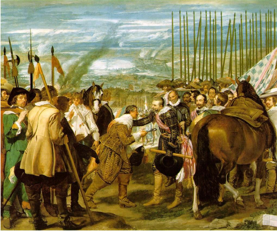
Diego Velazquez, "The Surrender of Breda" / "The Lances", 1634-1635 Museo del Prado, Madrid, Spain