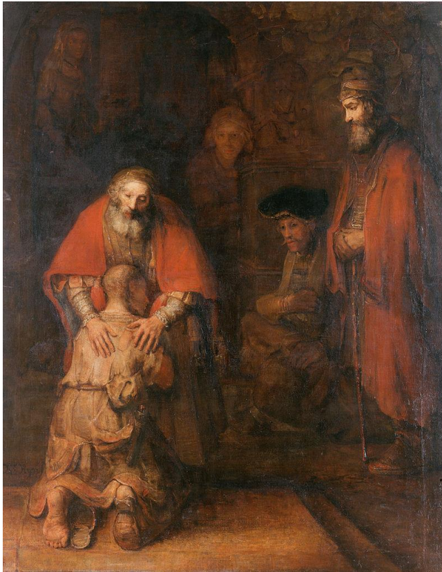
Rembrandt van Rijn, "The Return of the Prodigal Son", 1661-1669 Hermitage Museum, Saint Petersburg, Russia